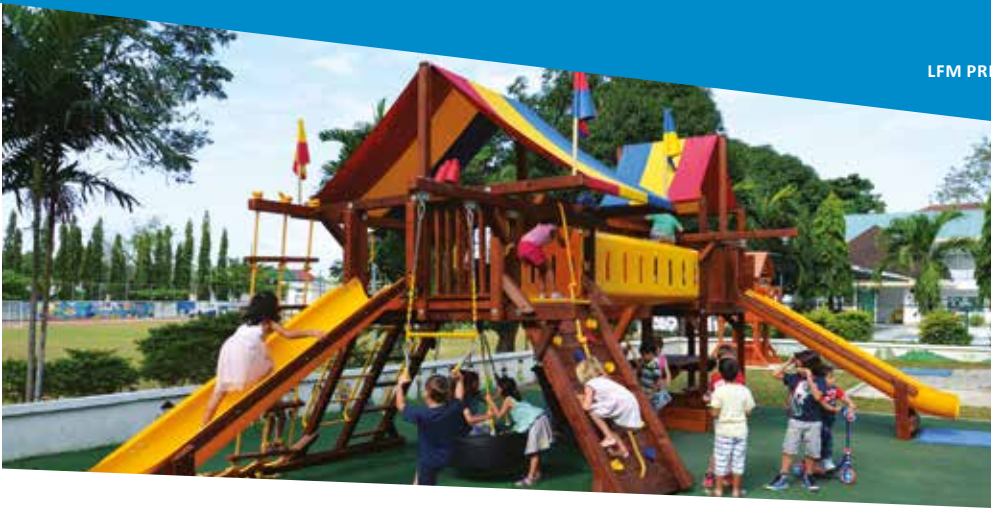
Spacious sports grounds