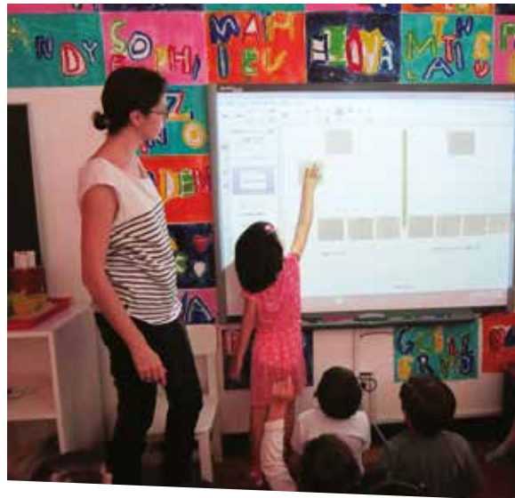
Advanced digital equipment