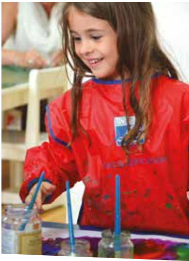
Visual and performing arts